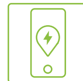
Select POD Point In App